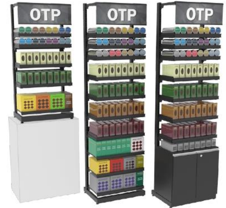
Floor stand and counter top fixture heights

Optional storage space. Signature open side profile. Lit and Non-lit header options.